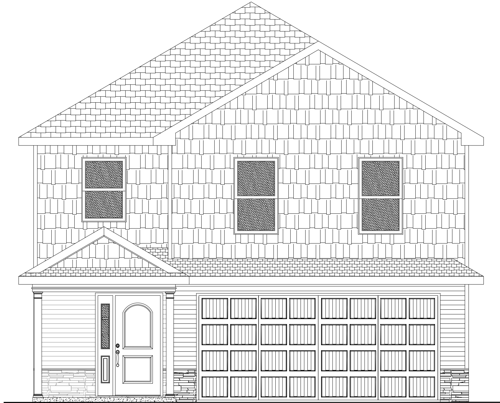
ELEVATION B - STONE FRONT RUBY TRACT HOUSE