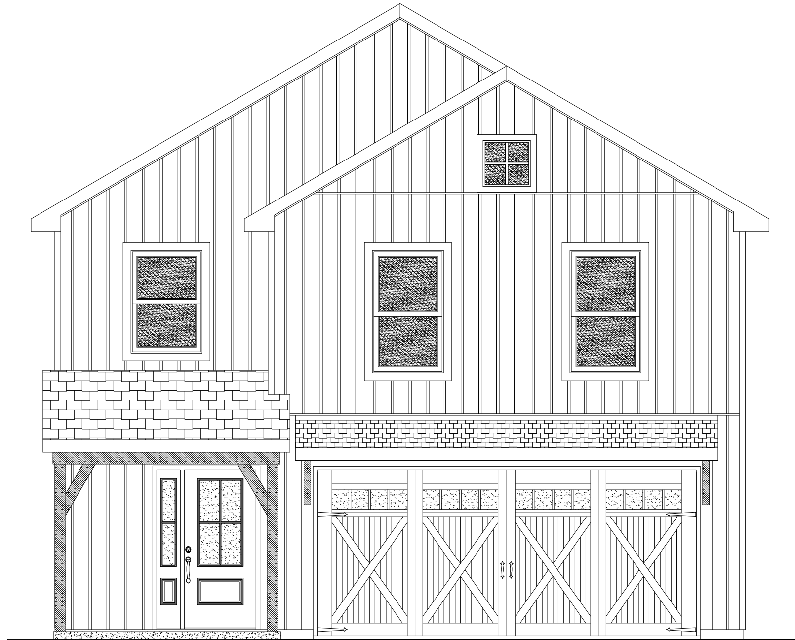
ELEVATION E - FARM HOUSE RUBY TRACT HOUSE