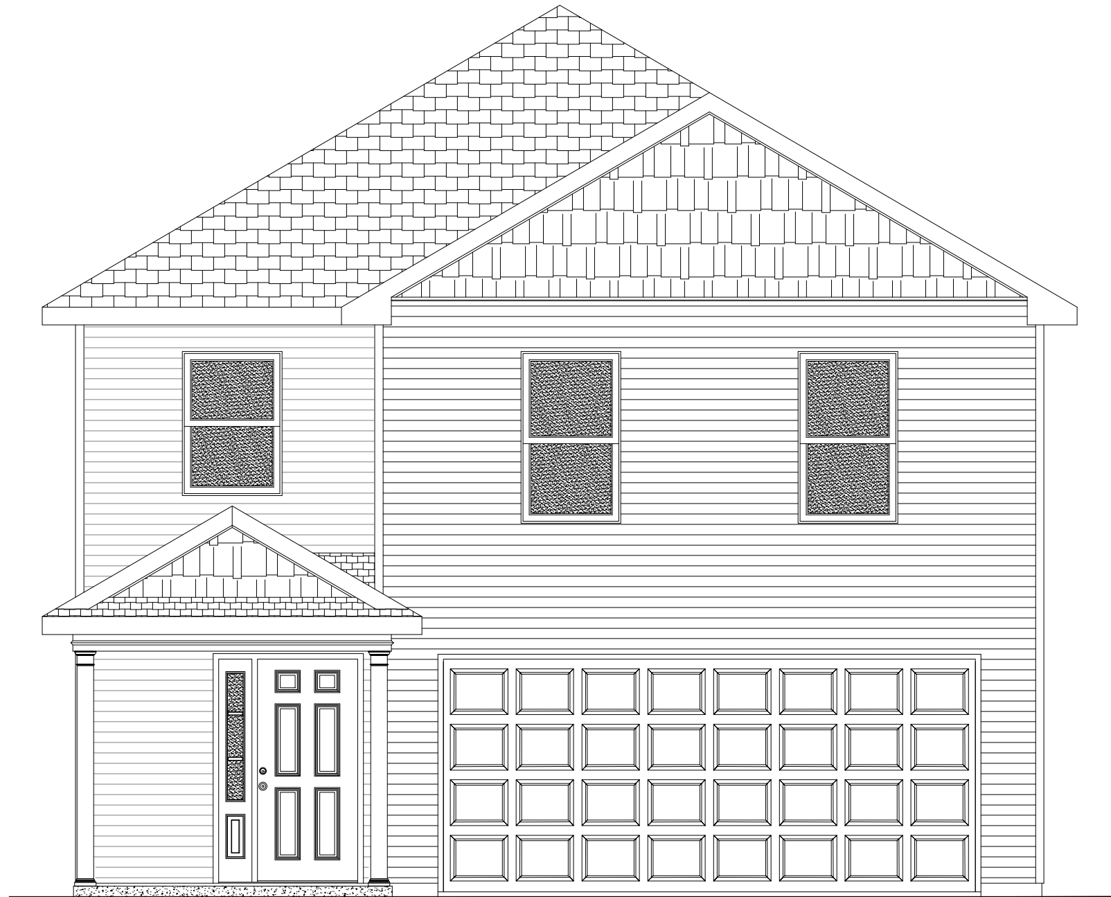
ELEVATION A - BASE VINYL RUBY TRACT HOUSE