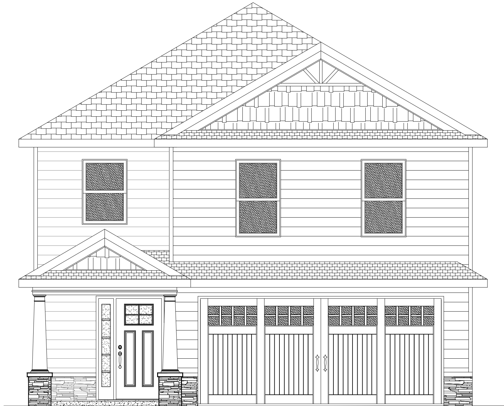
ELEVATION D - CRAFTSMAN RUBY TRACT HOUSE