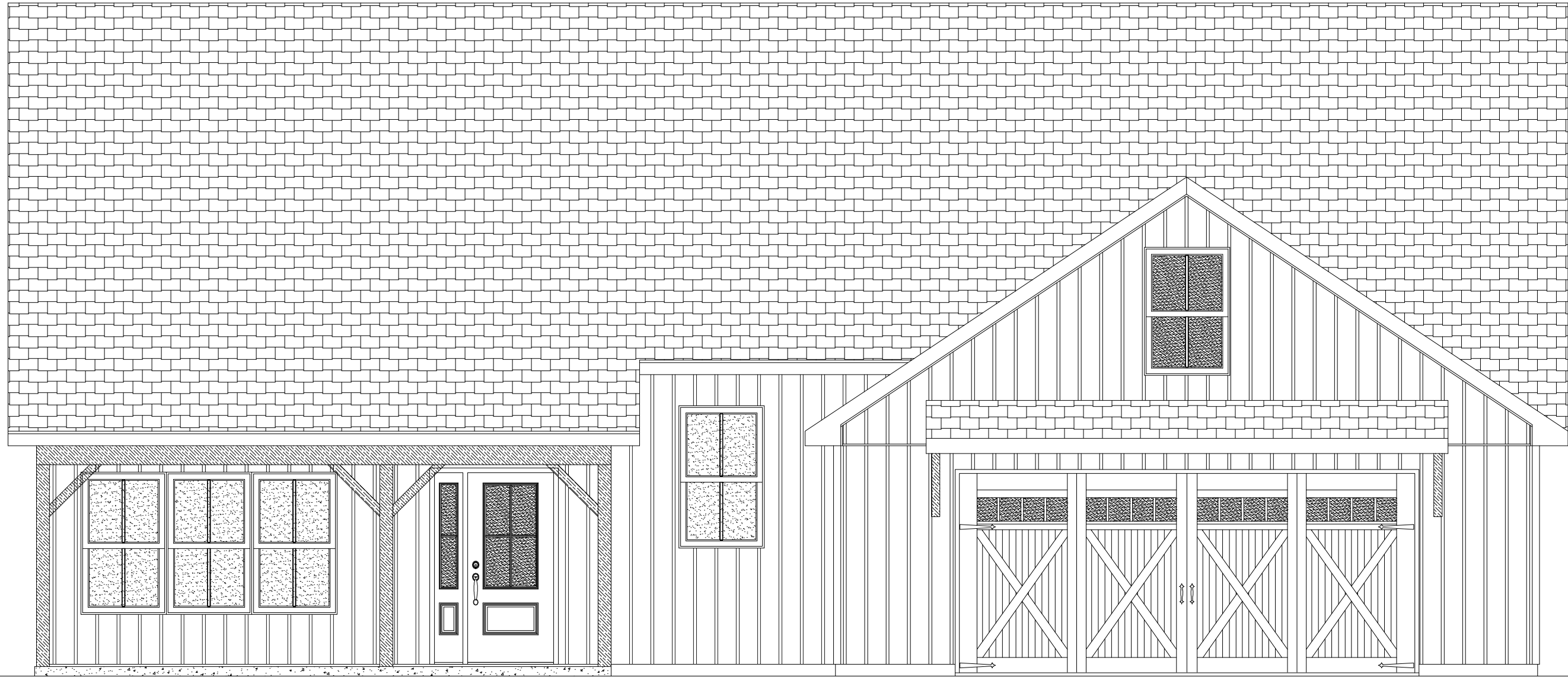
ELEVATION E - FARM HOUSE HEMLOCK TRACT HOUSE