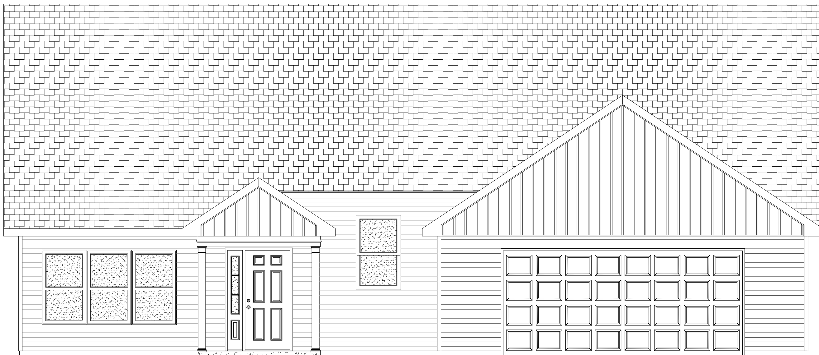
ELEVATION A - BASE VINYL HEMLOCK TRACT HOUSE