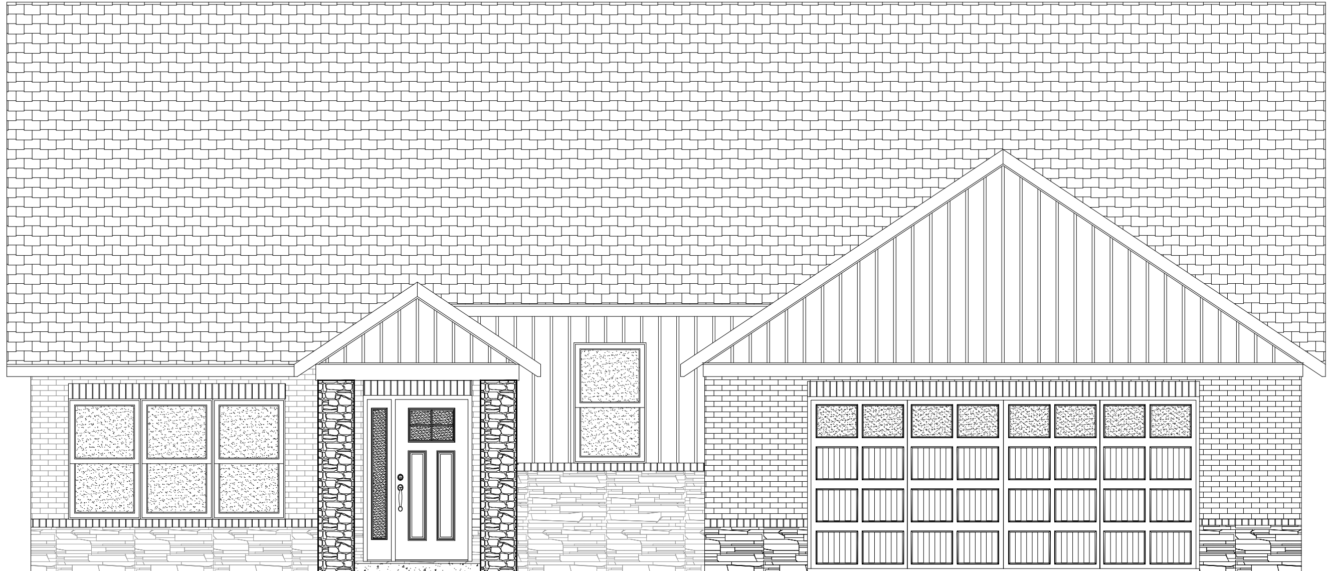
ELEVATION F - STONE & BRICK HEMLOCK TRACT HOUSE