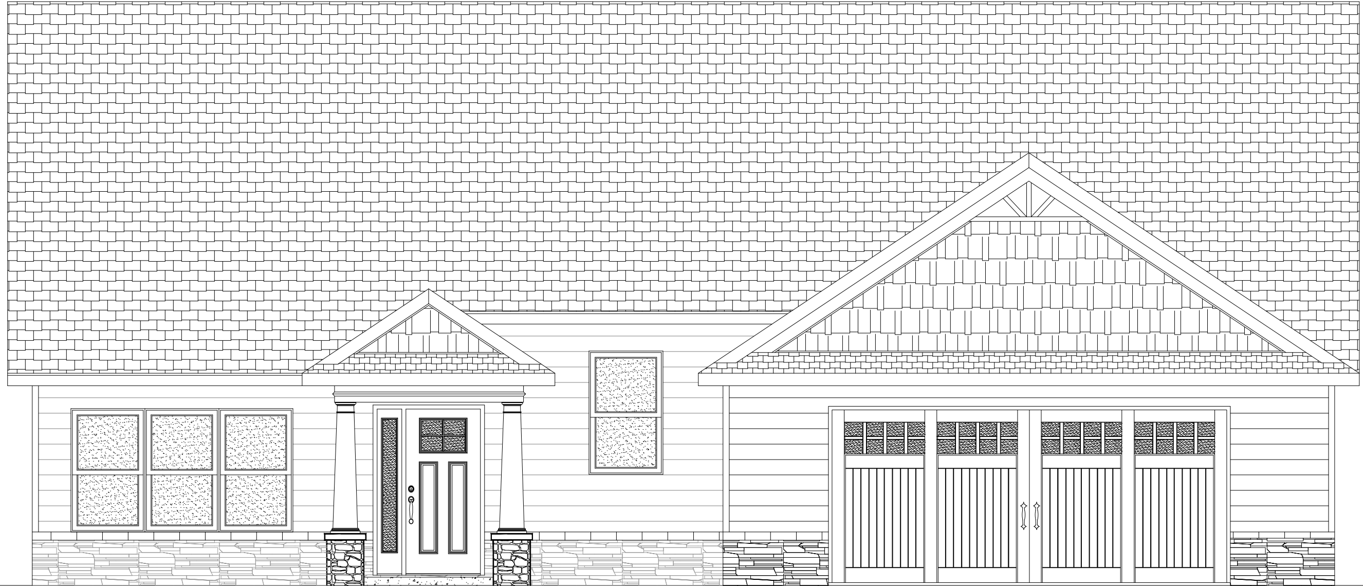
ELEVATION D - CRAFTSMAN HEMLOCK TRACT HOUSE