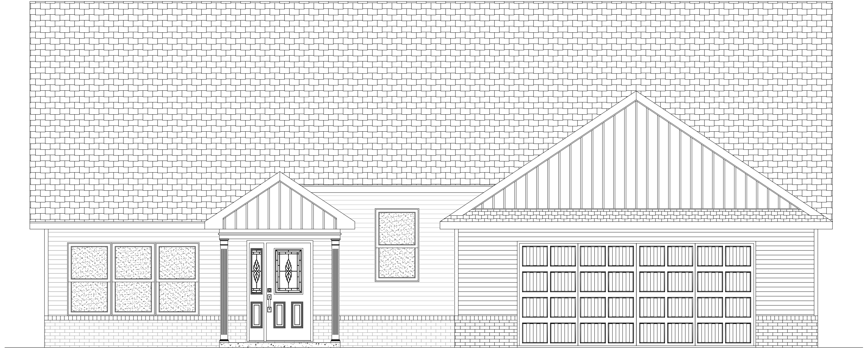
ELEVATION C - BRICK FRONT HEMLOCK TRACT HOUSE