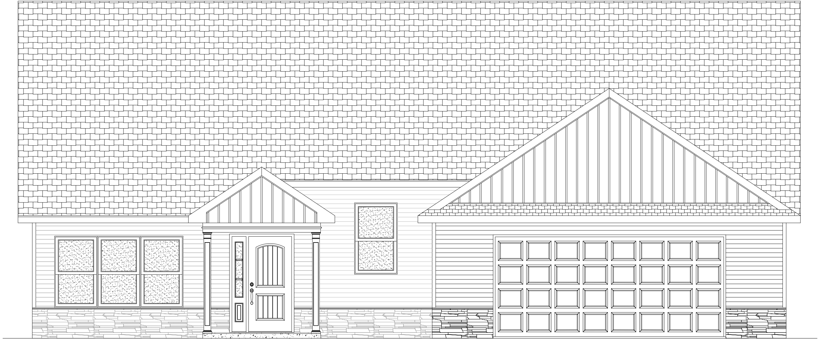
ELEVATION B - STONE FRONT HEMLOCK TRACT HOUSE