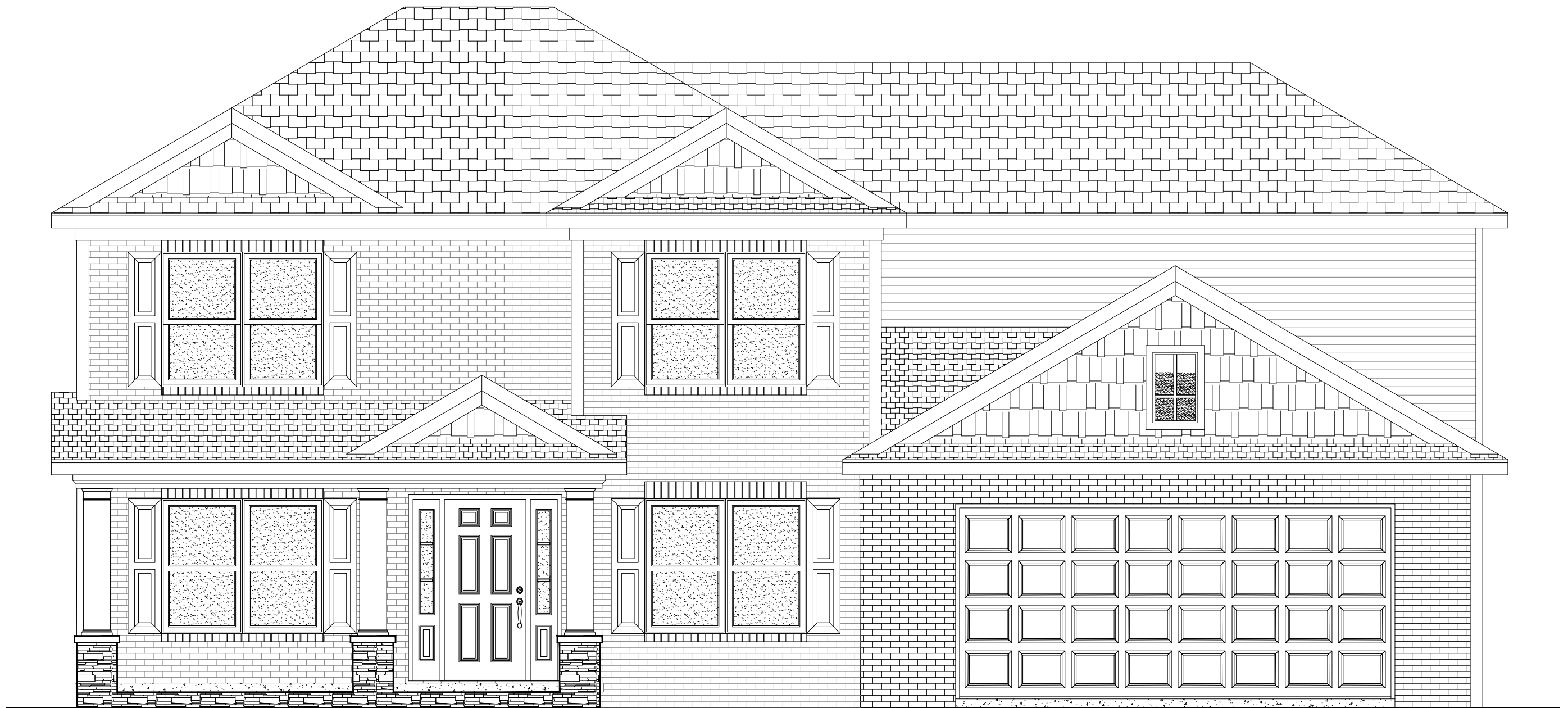
ELEVATION F - FULL BRICK FRONT CHERRY TRACT HOUSE: