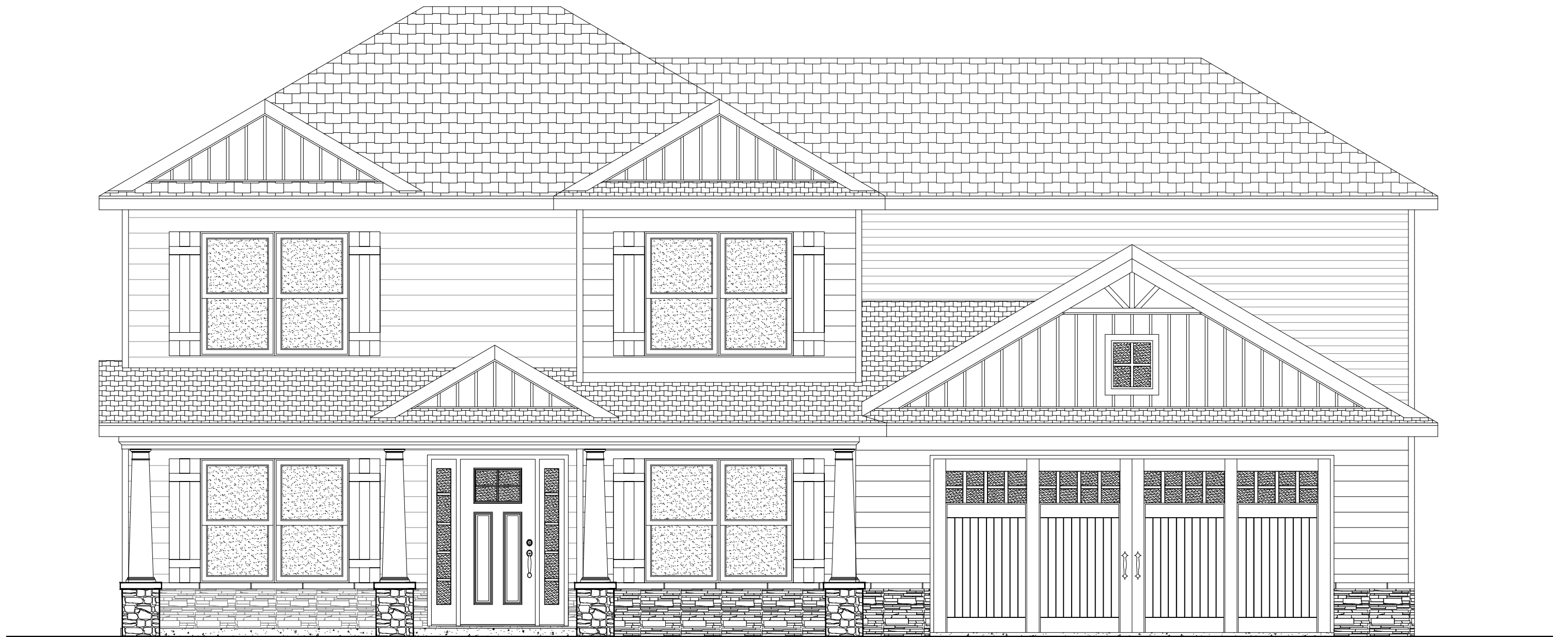
ELEVATION D - CRAFTSMAN CHERRY TRACT HOUSE