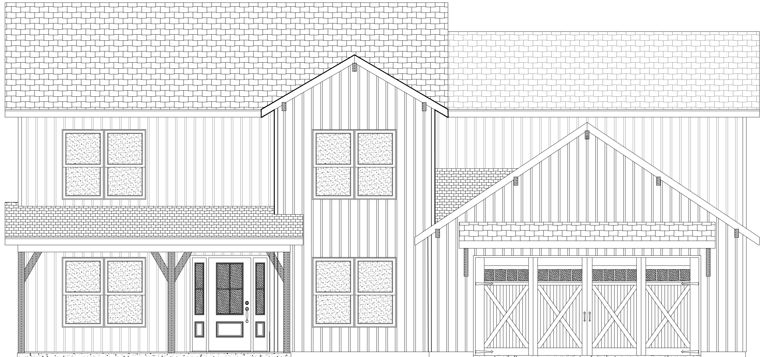
ELEVATION E - FARM HOUSE CHERRY TRACT HOUSE