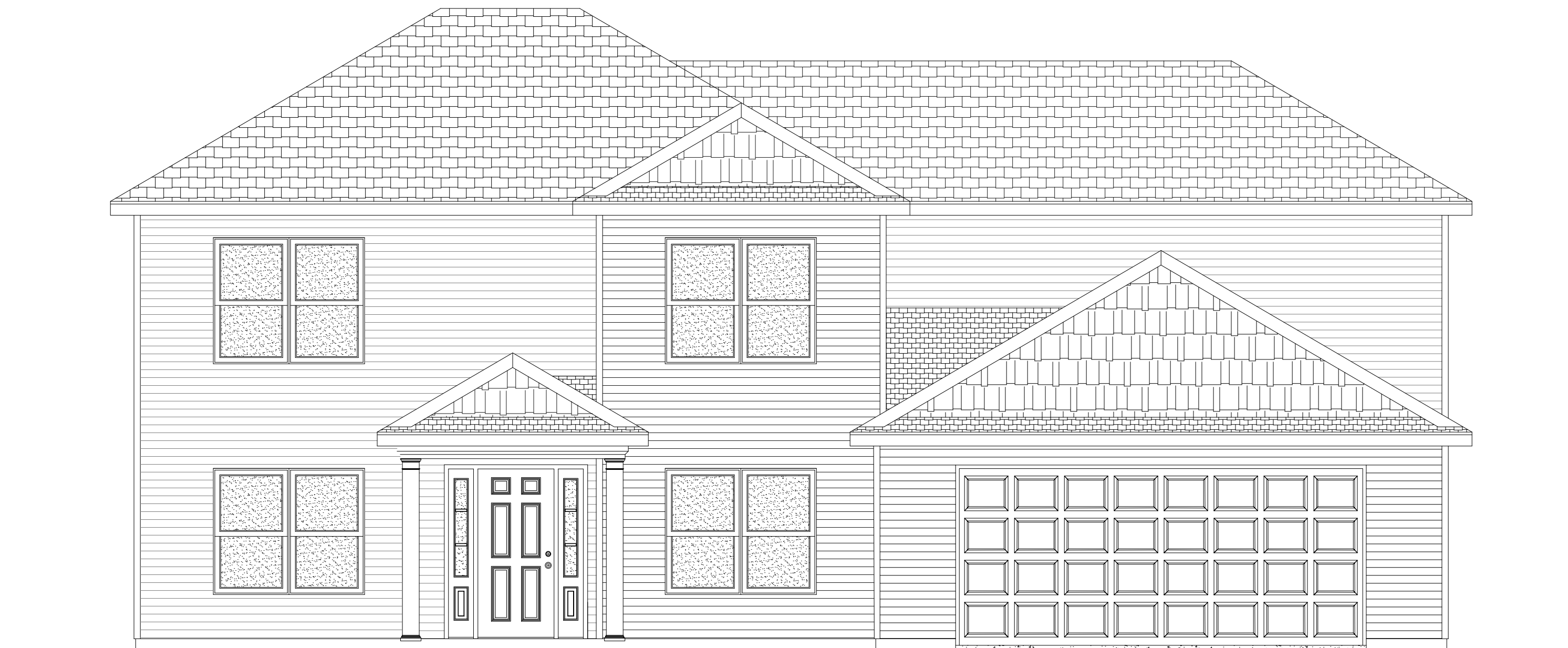
ELEVATION A - BASE VINYL CHERRY TRACT HOUSE