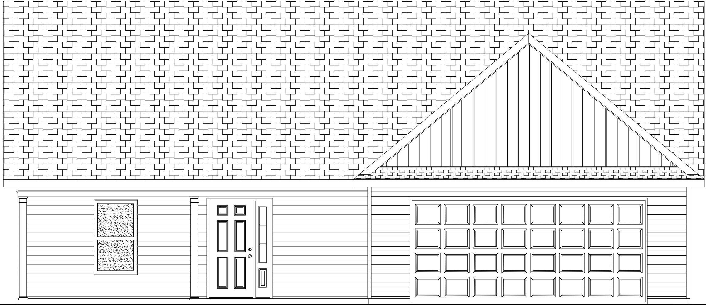
ELEVATION A - BASE VINYL ELM TRACT HOUSE