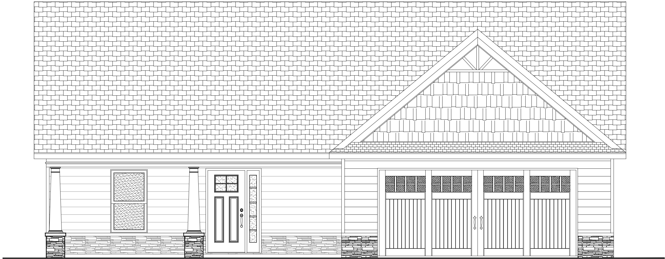
ELEVATION D - CRAFTSMAN ELM TRACT HOUSE