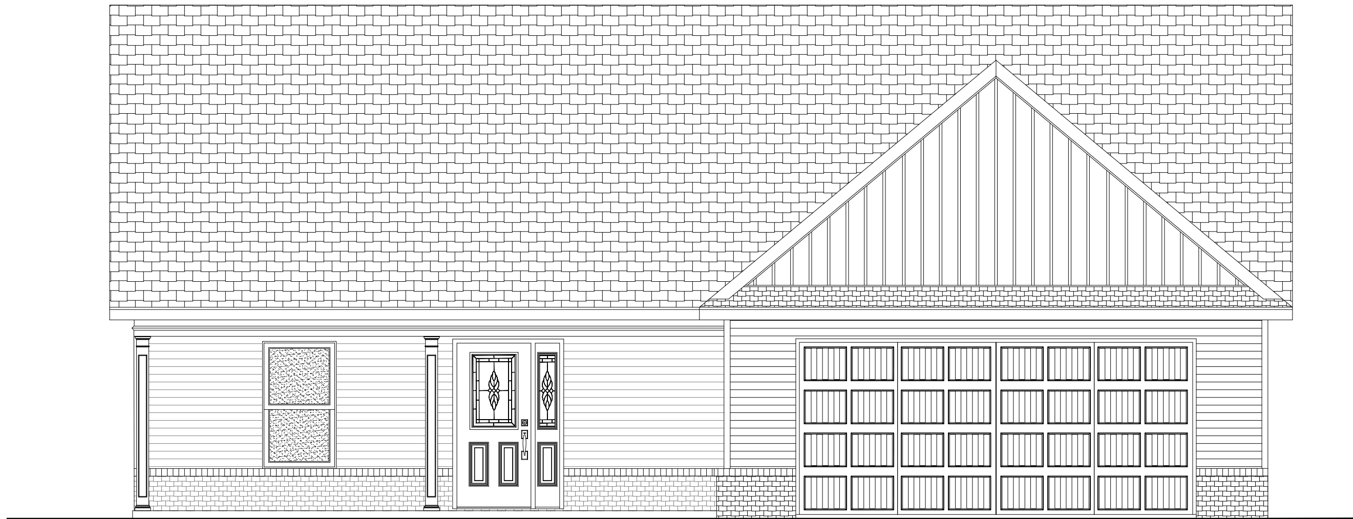
ELEVATION C - BRICK FRONT ELM TRACT HOUSE