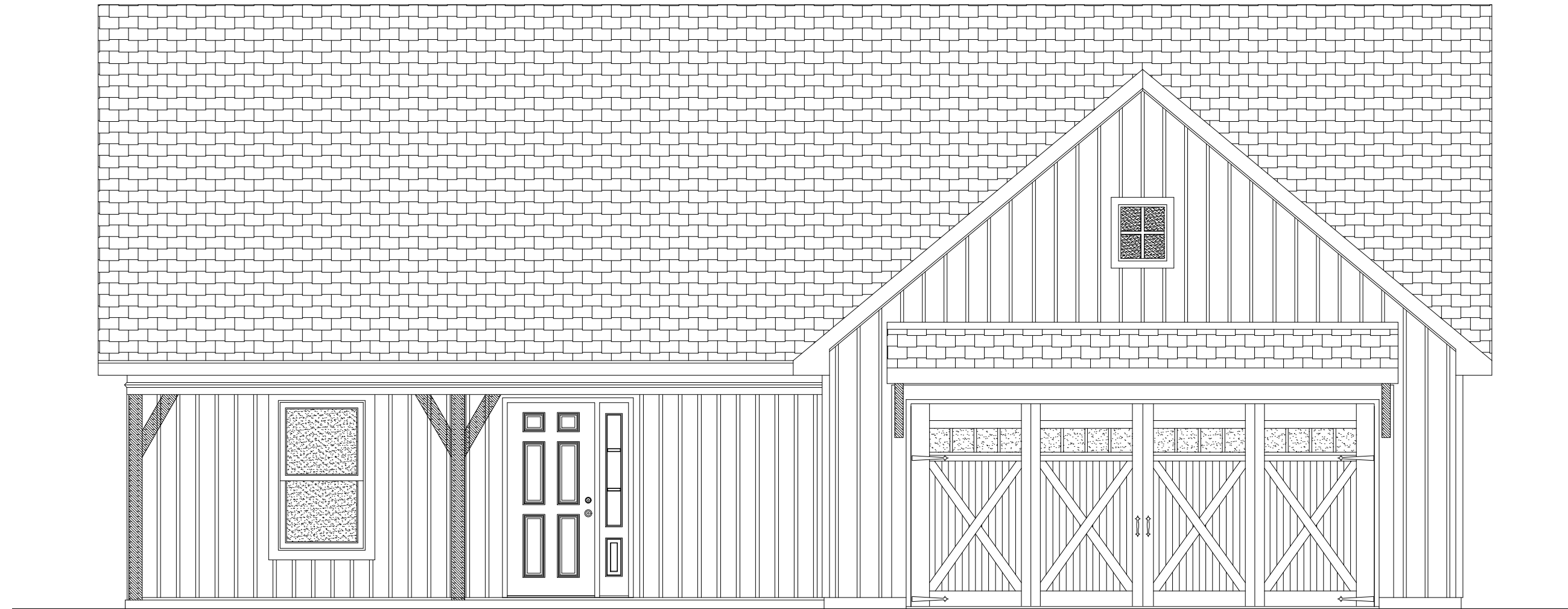
ELEVATION E - FARM HOUSE ELM TRACT HOUSE