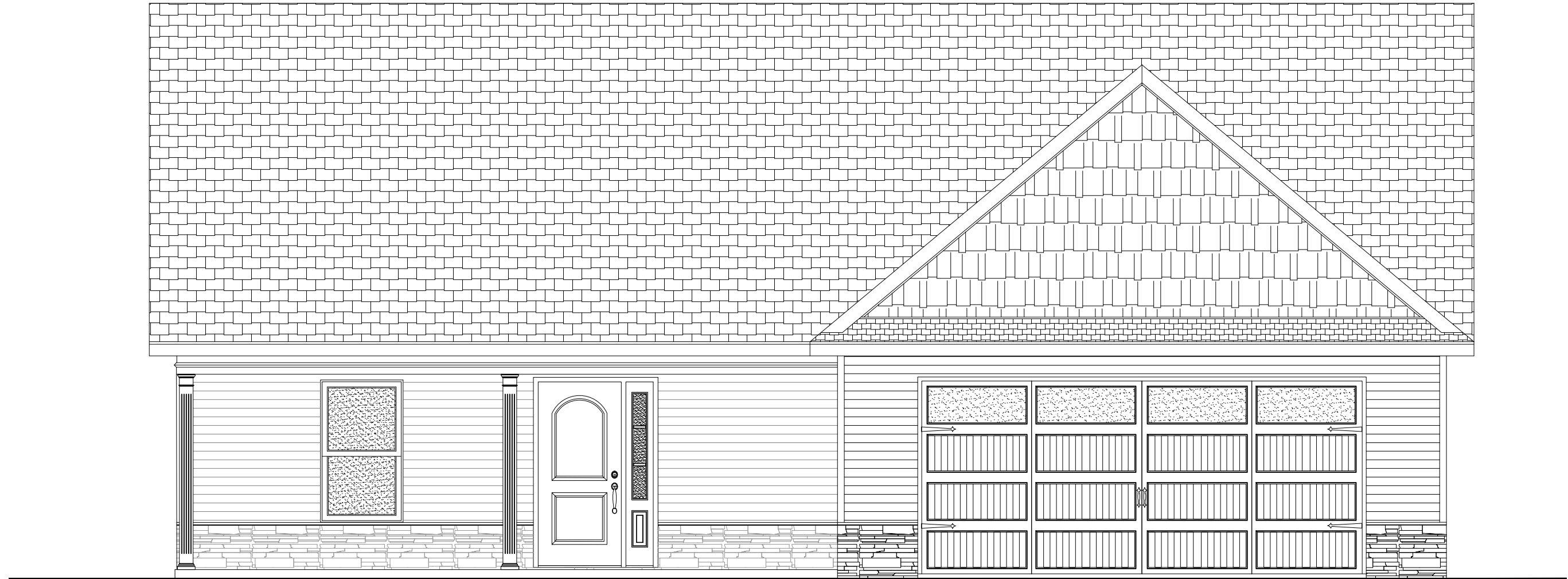
ELEVATION B - STONE FRONT ELM TRACT HOUSE