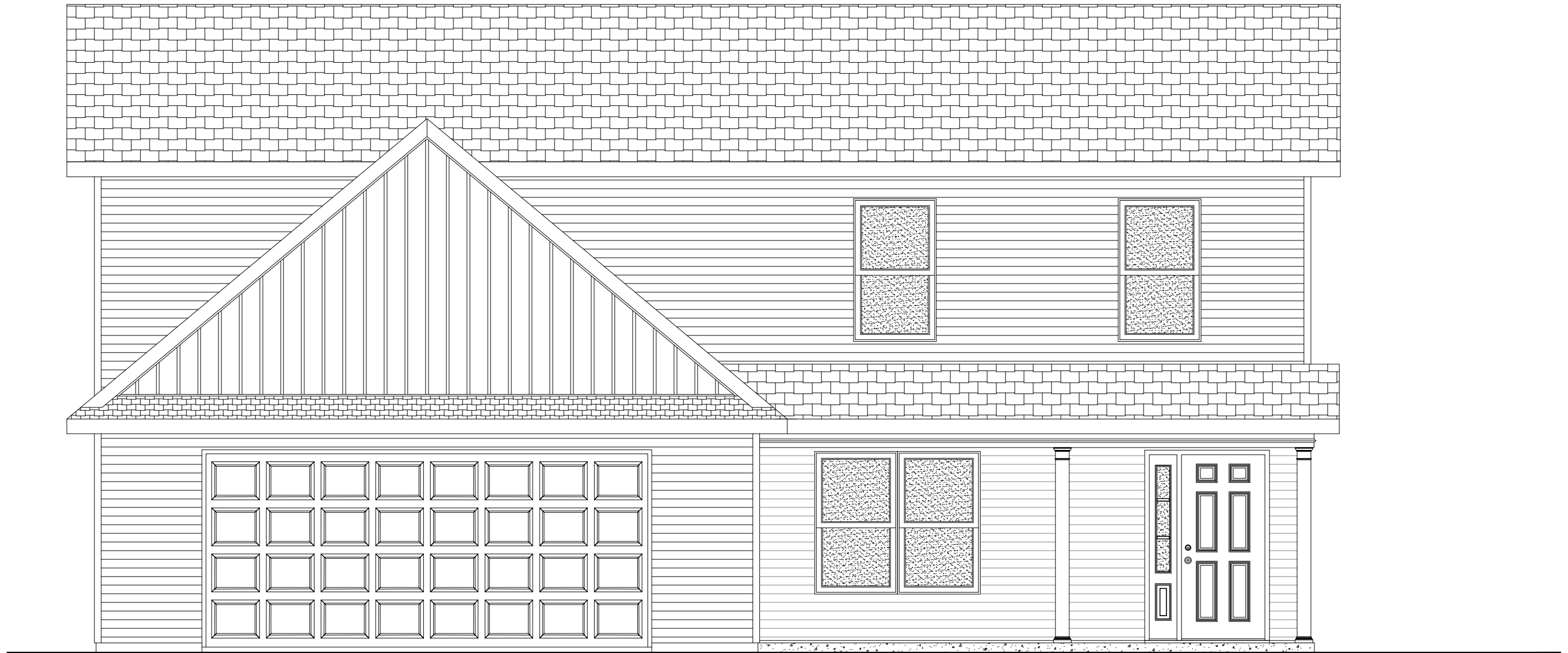
ELEVATION A - BASE VINYL TULIP TRACT HOUSE