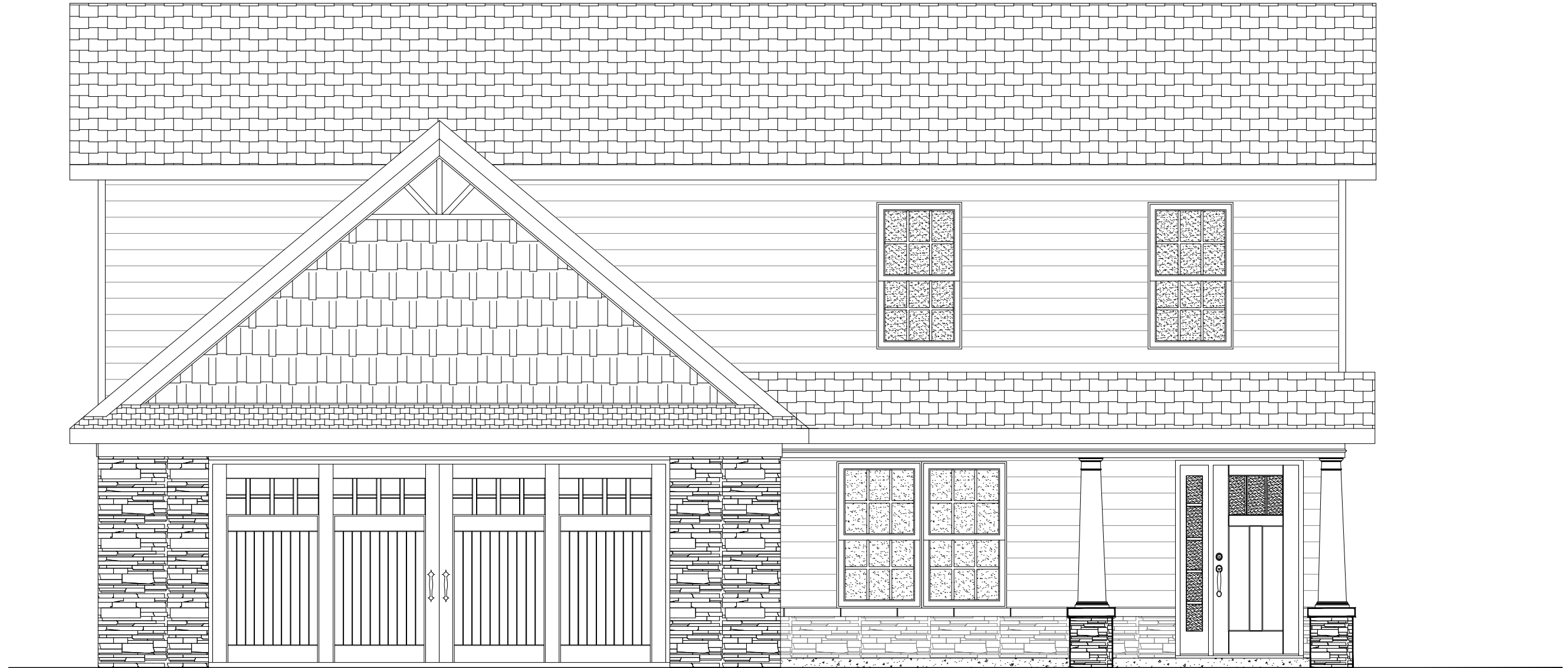
ELEVATION D - CRAFTSMAN TULIP TRACT HOUSE