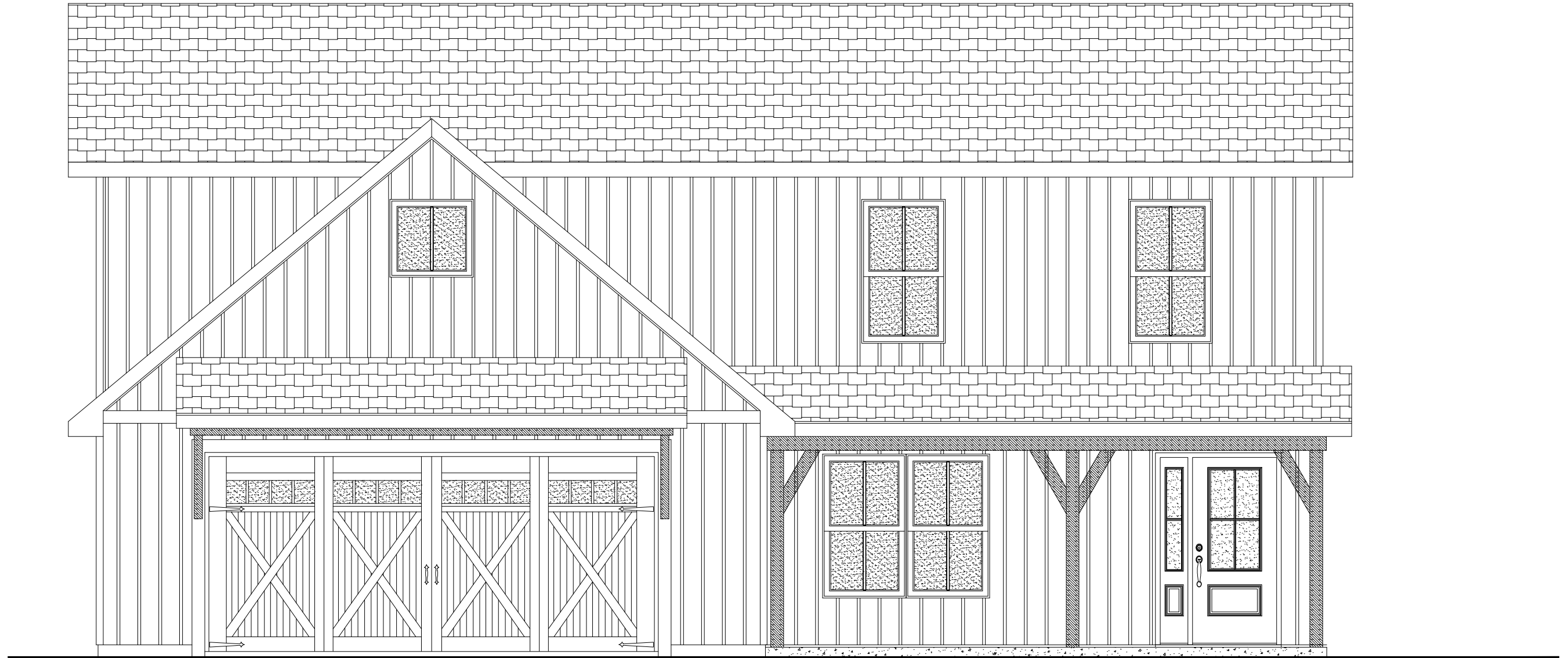
ELEVATION E - FARM HOUSE TULIP TRACT HOUSE