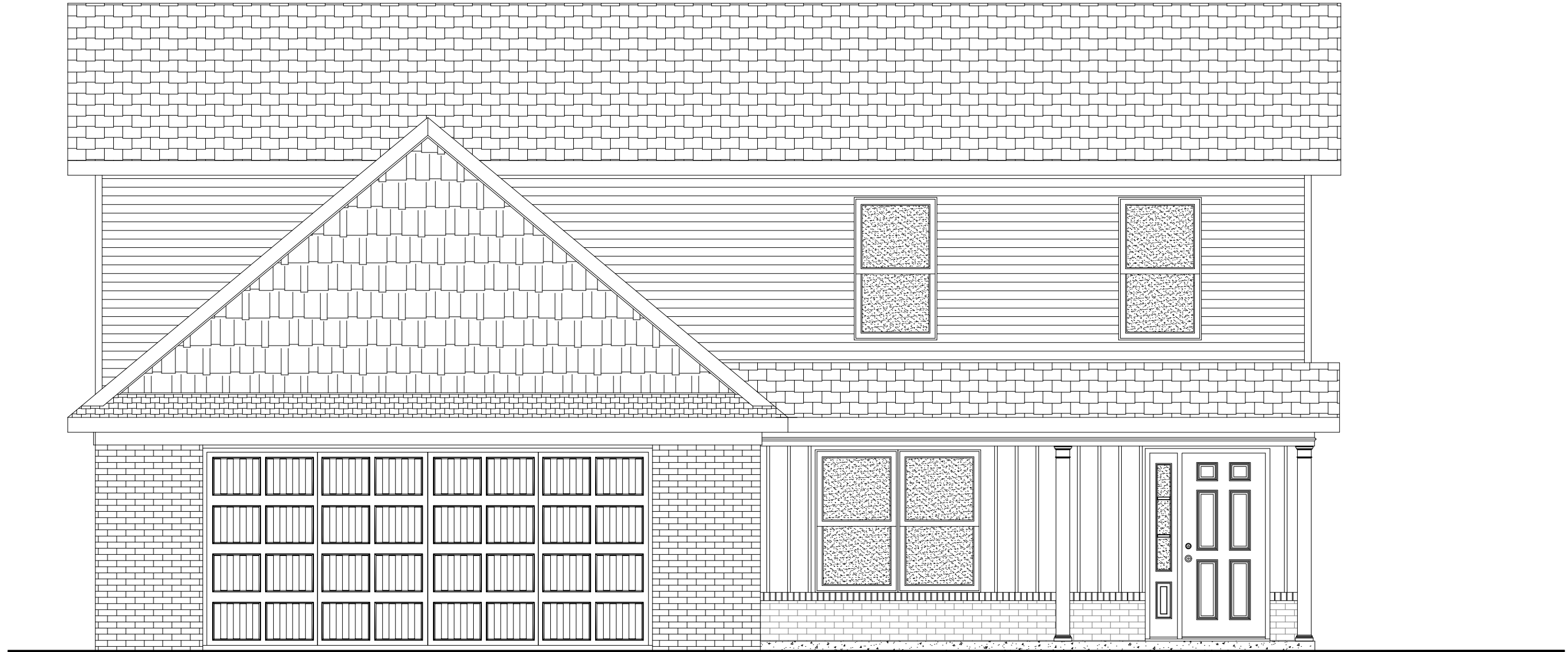
ELEVATION C - BRICK FRONT TULIP TRACT HOUSE