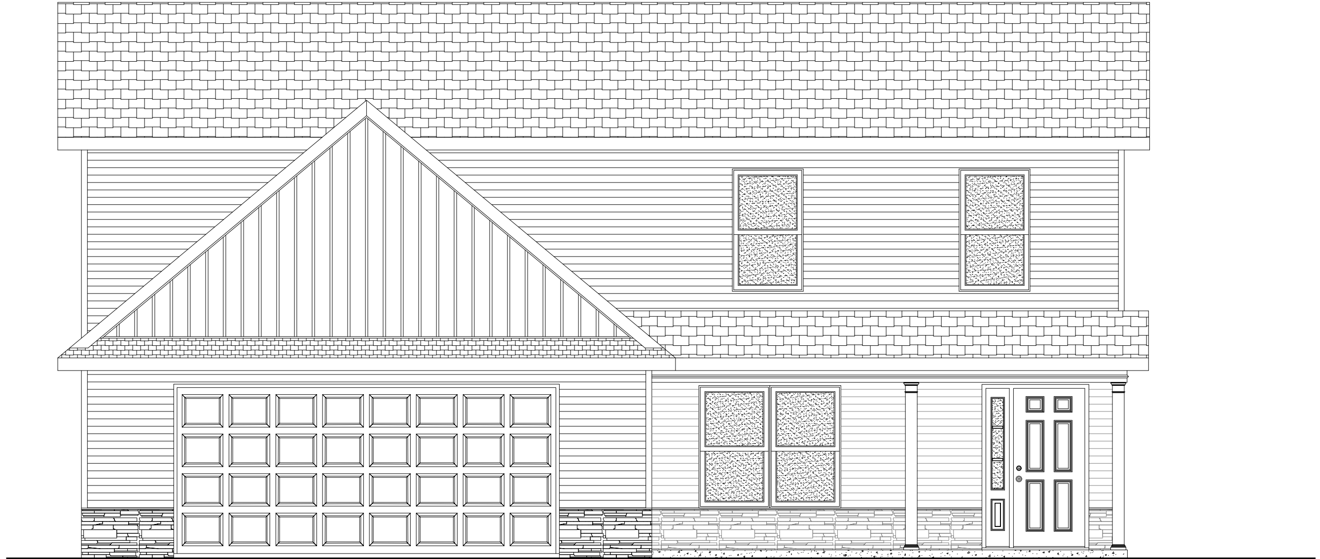
ELEVATION B - STONE FRONT TULIP TRACT HOUSE