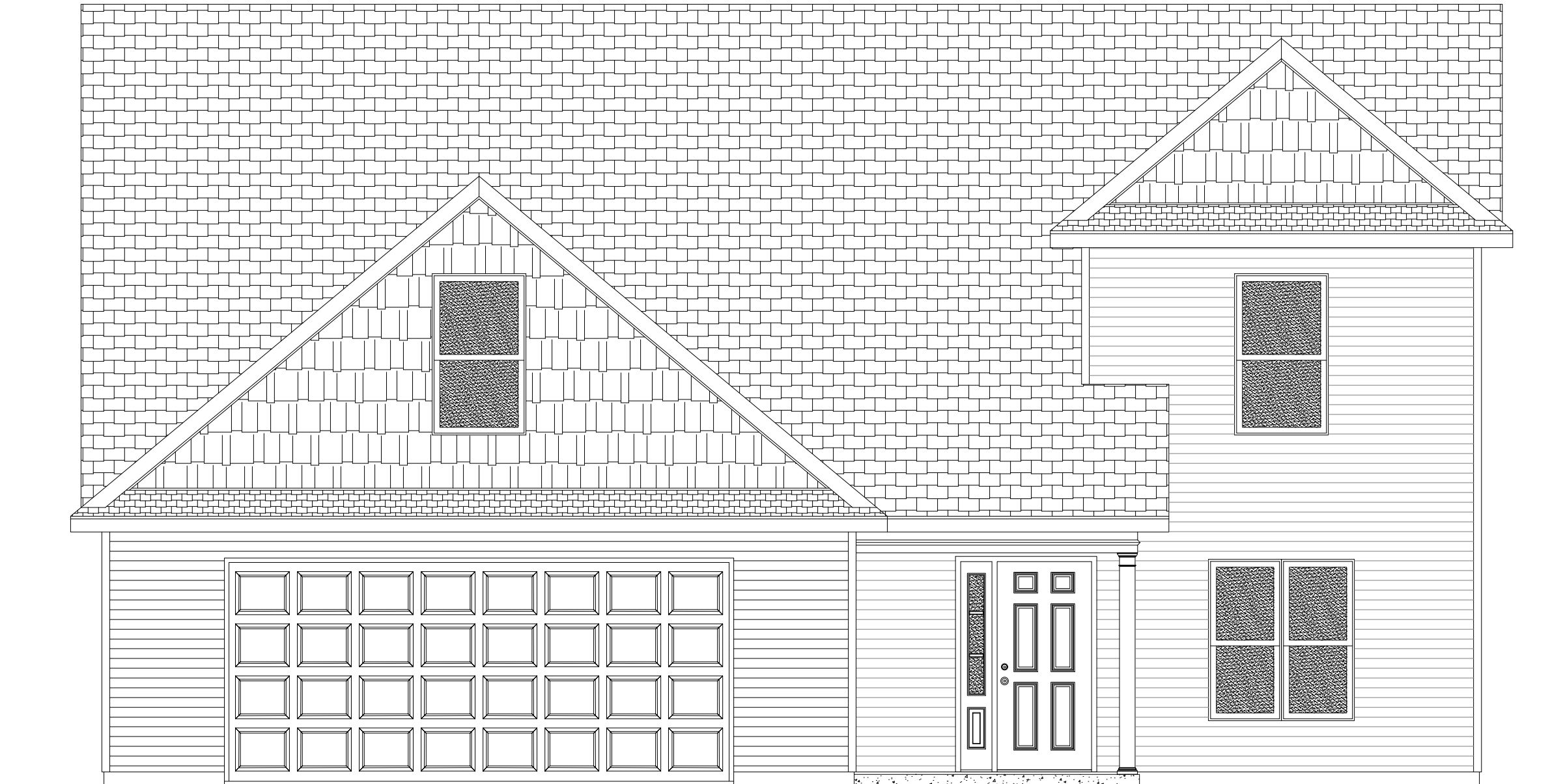
ELEVATION A - BASE VINYL CHESNUT TRACT HOUSE