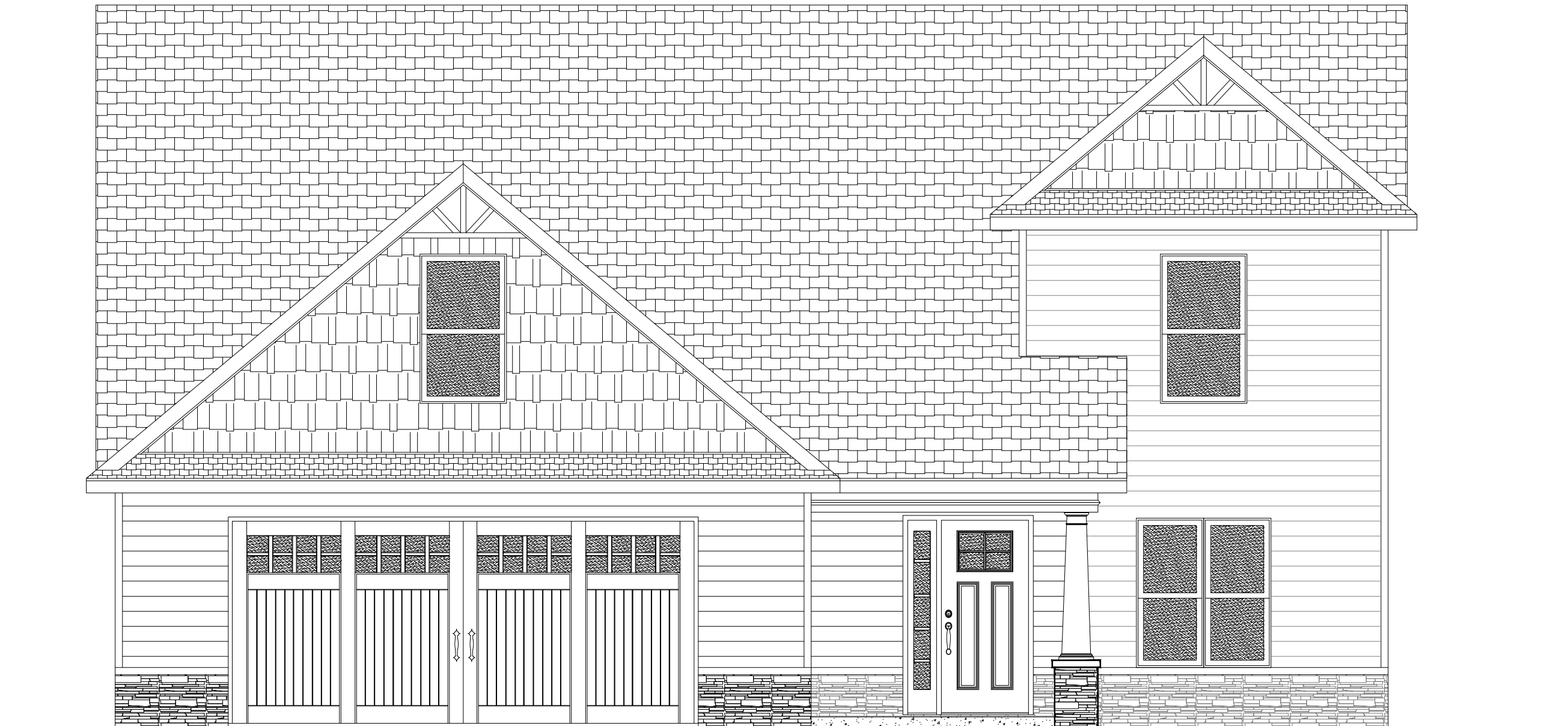
ELEVATION D - CRAFTSMAN CHESNUT TRACT HOUSE