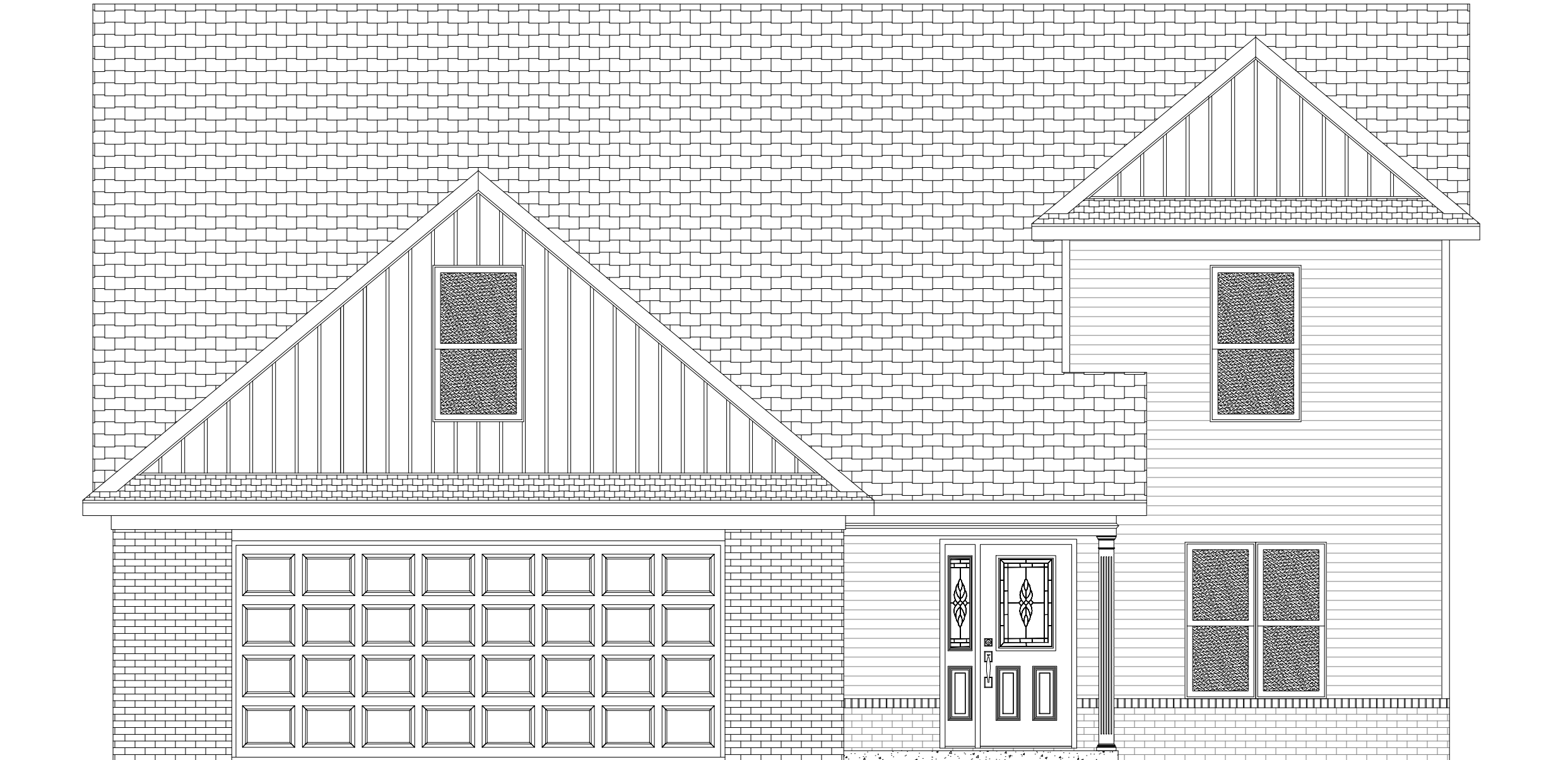
ELEVATION C - BRICK FRONT CHESNUT TRACT HOUSE