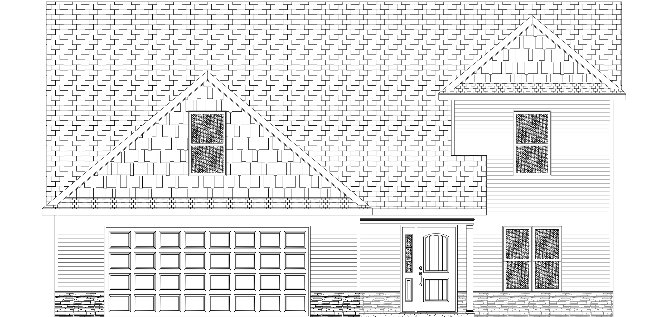
ELEVATION B - STONE FRONT CHESNUT TRACT HOUSE