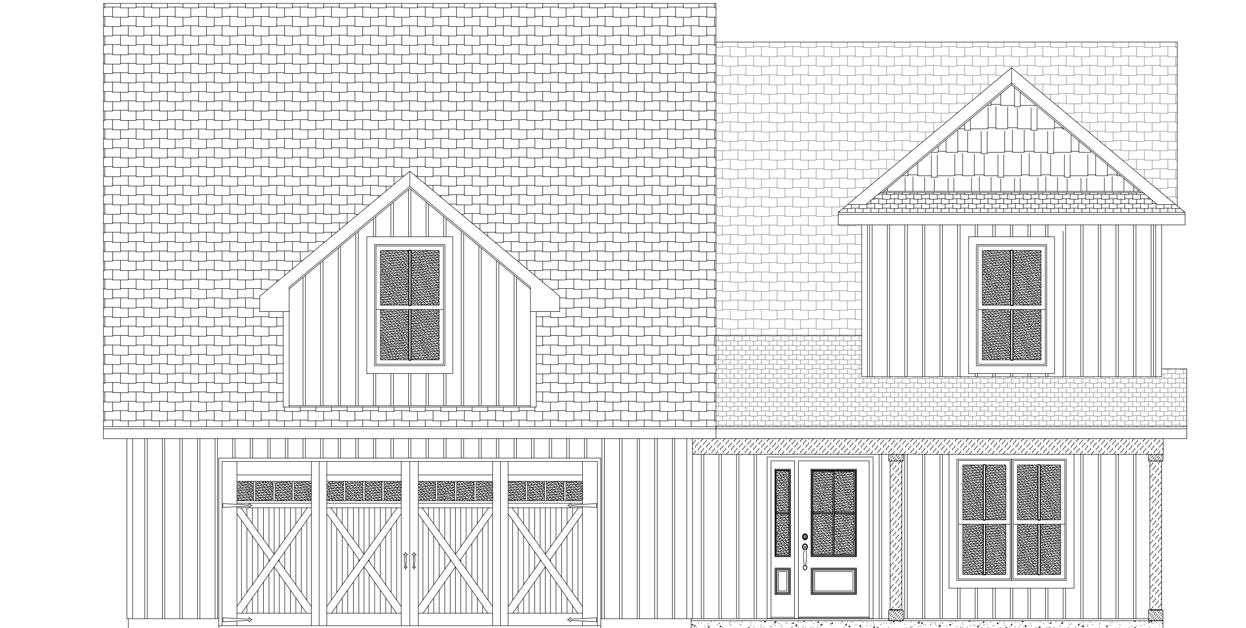
ELEVATION E - FARM HOUSE CHESNUT TRACT HOUSE